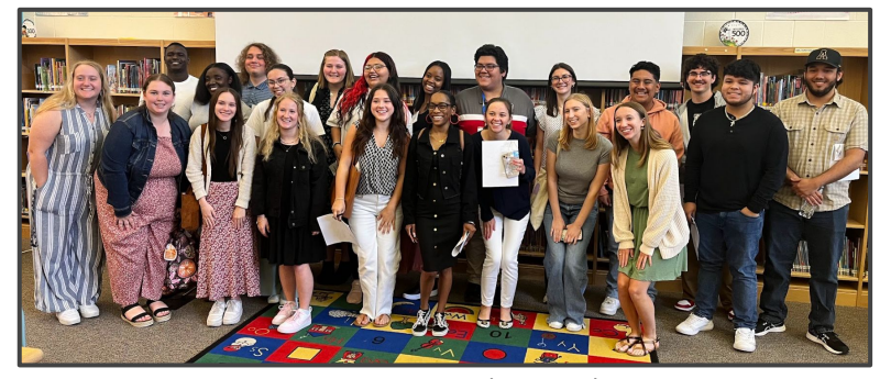
WCPSS Future Teachers Cohort 9